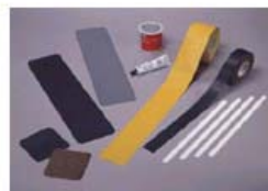
Anti Skid Solutions (Traction Tapes for Building & Equipments)