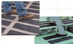
Anti Skid Solutions (Traction Tapes for Building & Equipments)