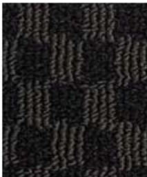
NOMAD AQUA MATTING

ELEMENTS: Hard dried mud, dry loose mud, wet sticky mud, dry sand & pebbles, fine dust & moisture.