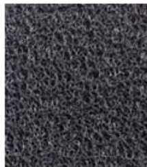
NOMAD TERRA LOOP