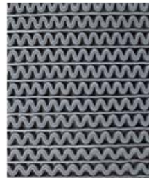
NOMAD TERRA Z WEB