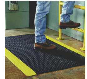
Assembly Shop Floor