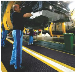
Automotive Assembly lines