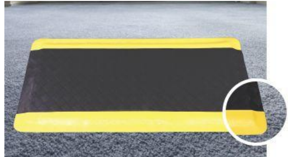
Duro Active Product