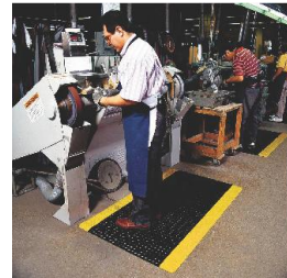
Engineering Work Shop