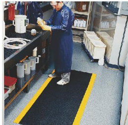
Laboratories, Hotels, Hospital, Pharmaceutical /Medical