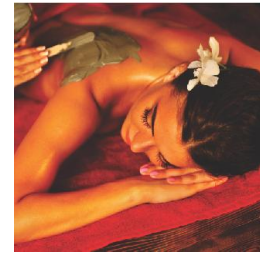
Spas, Beauty Parlours